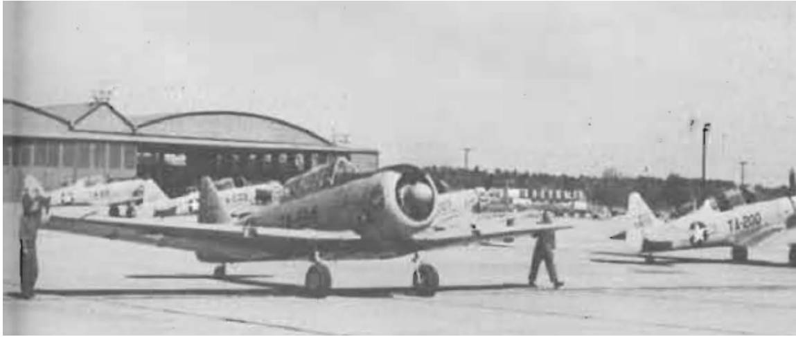
3306 Training Squadron (Contract Training), Bainbridge AB, GA, T-6 taxiing.