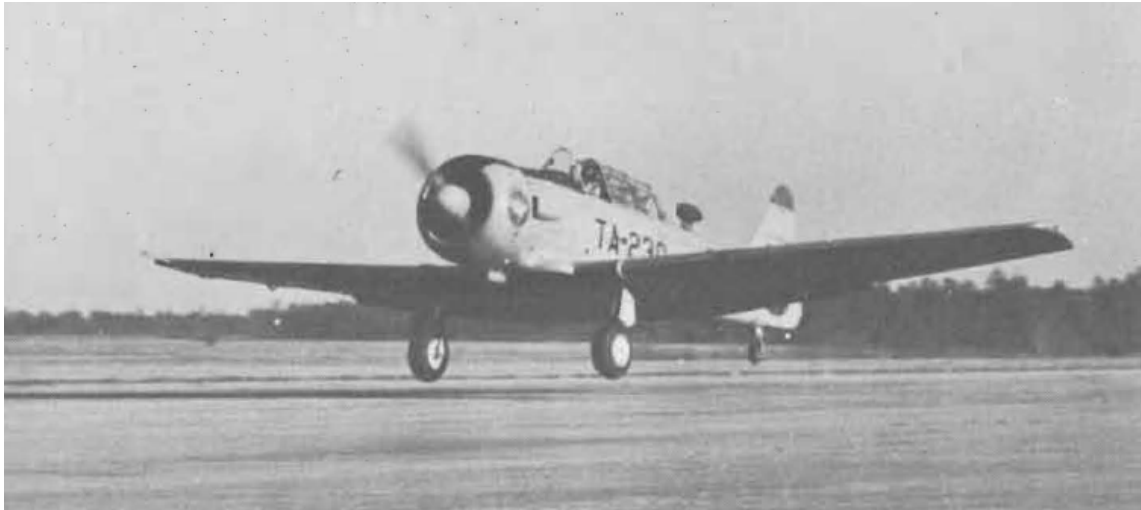
3306 Training Squadron (Contract Training), Bainbridge AB, GA, T-6.