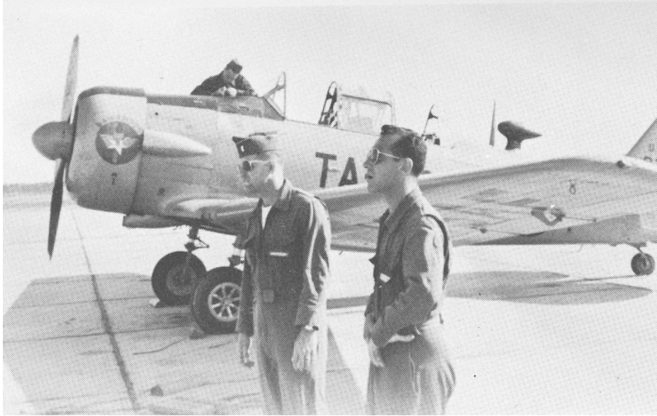
3306 Training Squadron (Contract Training), Bainbridge AB, GA, T-6 and student pilots.